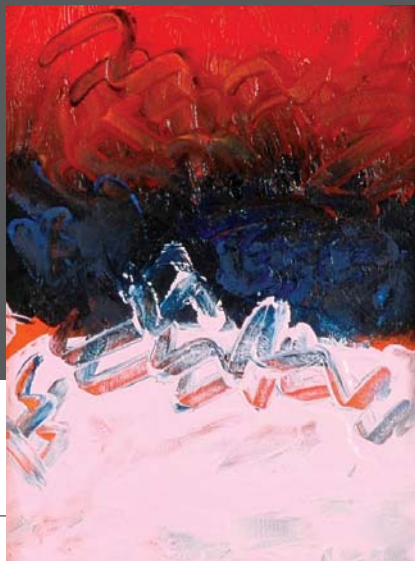
Wrong Use of Centers / 2004 Oil on Canvas 8" x 10"