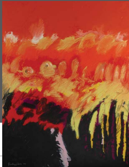
Distraction of the Senses / 2004 Oil on Canvas 19" x 27"